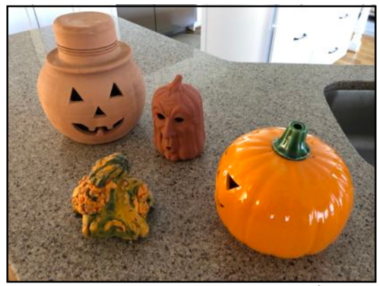
you are one ug-ly pumpkin!