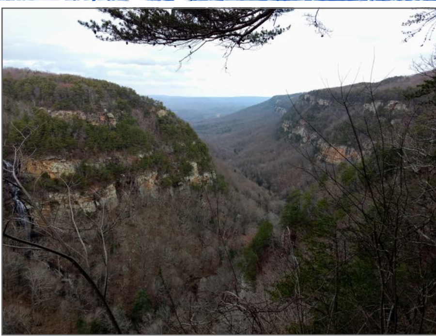
Easy to see how Cloudland Canyon got its name