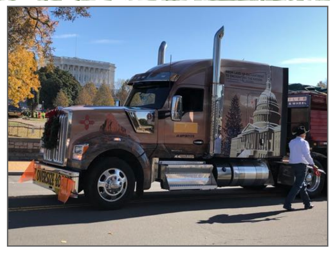
"From Land of Enchantment to Enchanting the Nation Carson National Forest, NM to Washington DC"