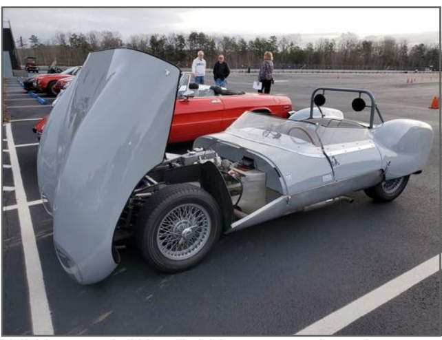
Phil Hungate's Westfield is a recreation of a 1956 Lotus 11. She uses a Spridget donor for engine and drivetrain, i.e. 1275cc and 4-speed ribcase transmission. The car is titled as a 1984 and is number 49 of an initial run of 200 cars. The circles are headrests incorporated in the customized roll bar.