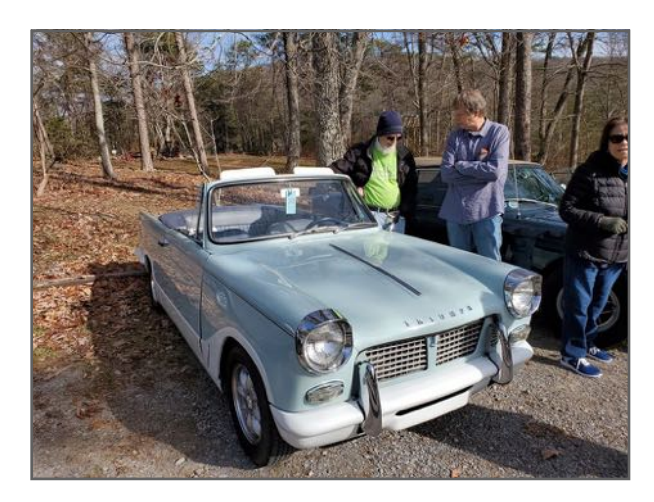
The Cheij's Herald Sport