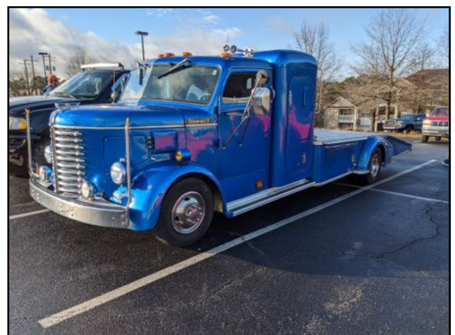
Slickest Diamond T flatbed in town