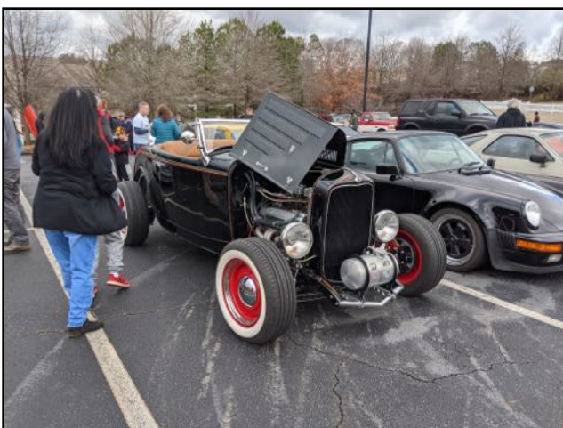
Very nice 32 Ford