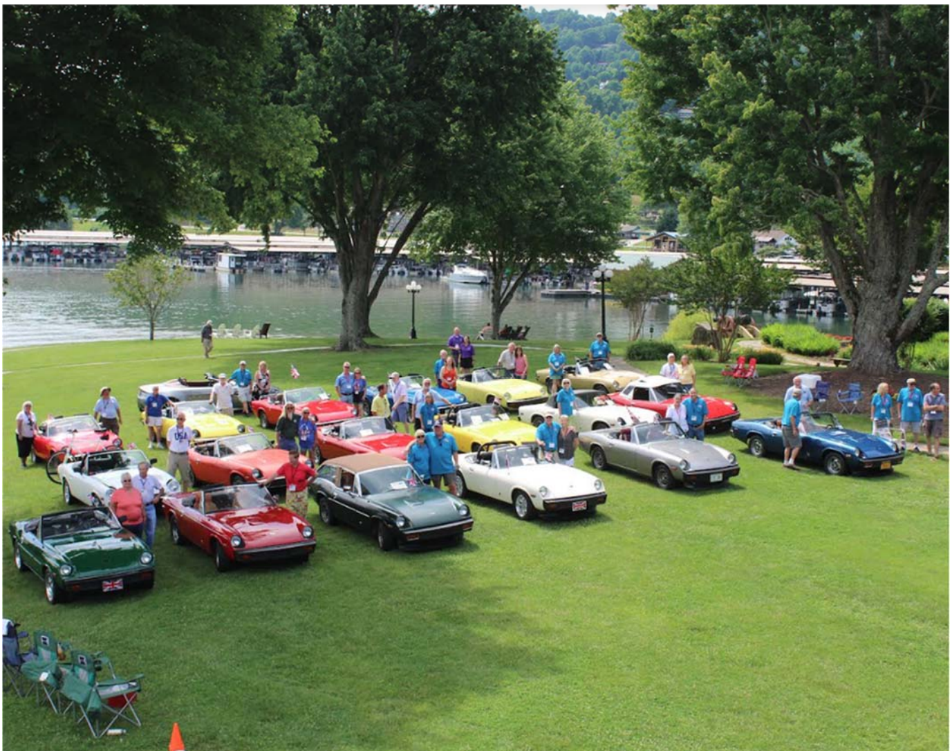
Jensen East Gathering at Lake Chatuge

Visit our Web Site: http://www.atlantahealeys.org