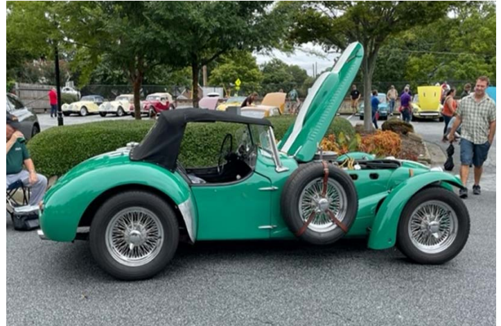
Rare Allard or copy there of