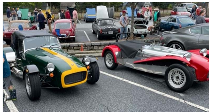
Colin Chapman's least favorite Lotus, but most copied and popular!