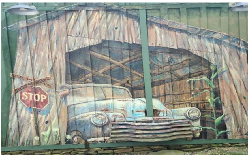
Find the hidden A/C Condenser