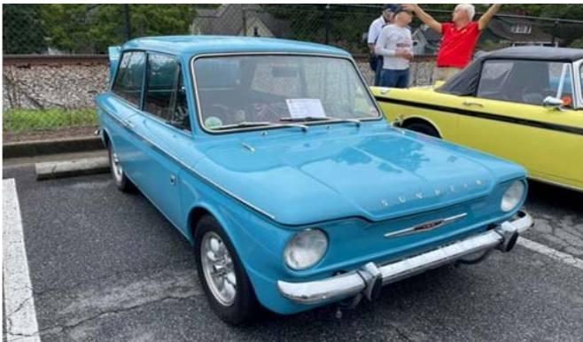
Feeling "IMP" ish?