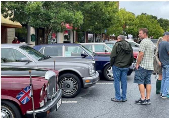
Not just little tiny cars, Brits had luxurious sedans as well...