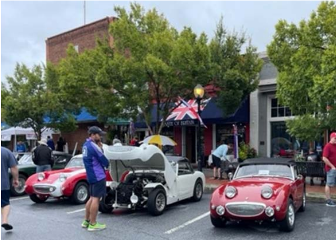
Frogeyes or Bugeyes come out in the rain