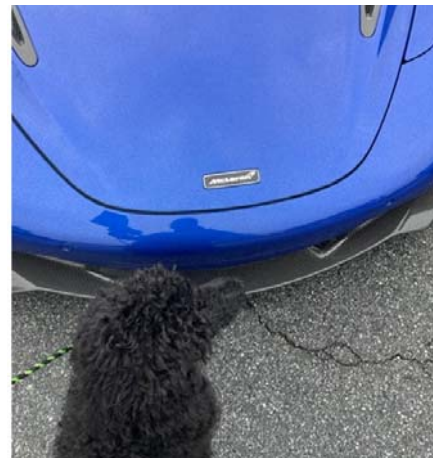
McLaren vs. McLaren