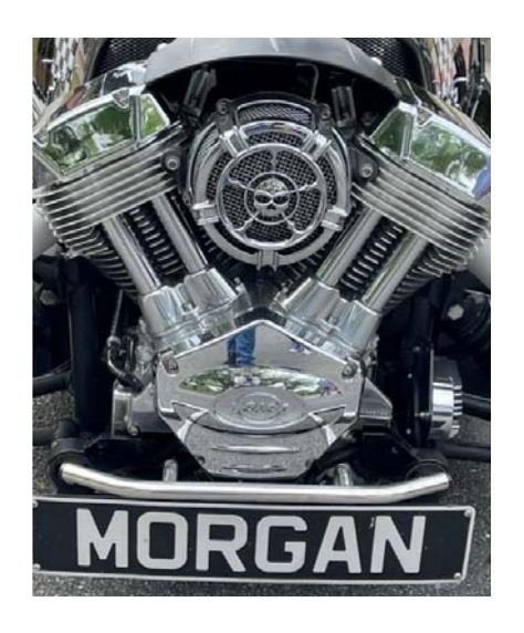
"Modern" Morgan 3-Wheeler