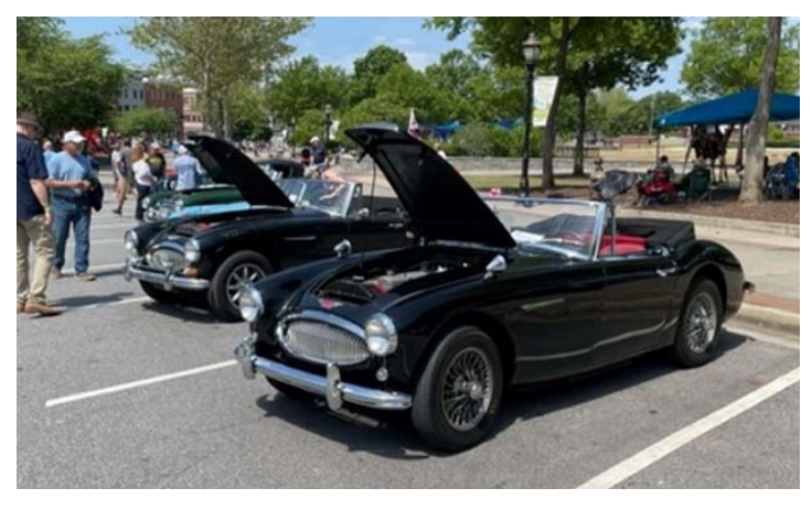
Healeys starting to line up for the show