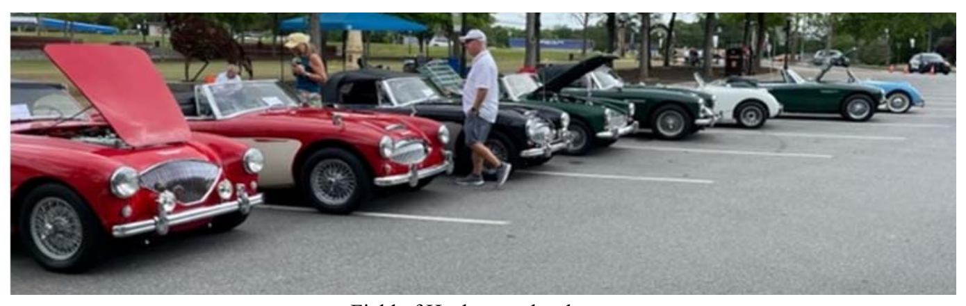
Field of Healeys at the show