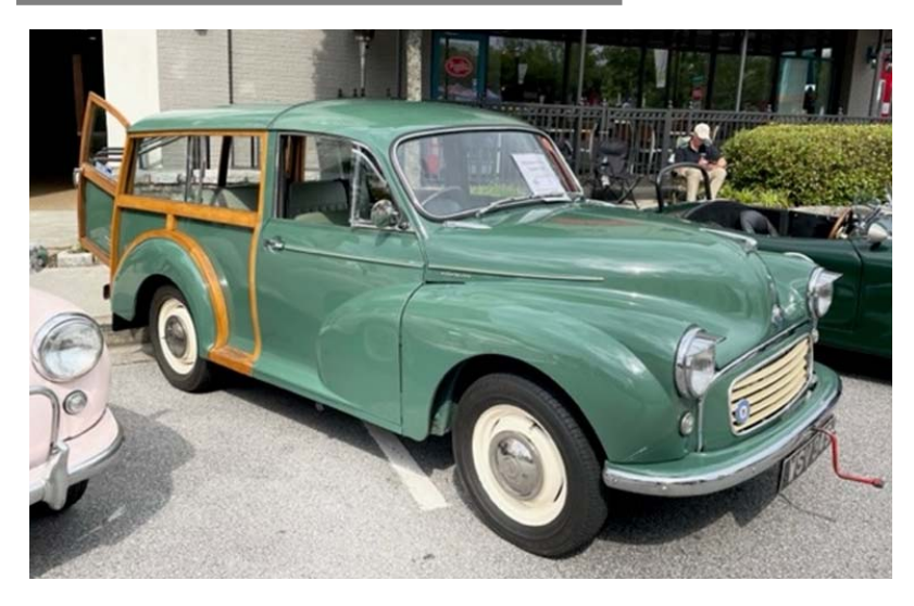
For the Road Less Traveler'd