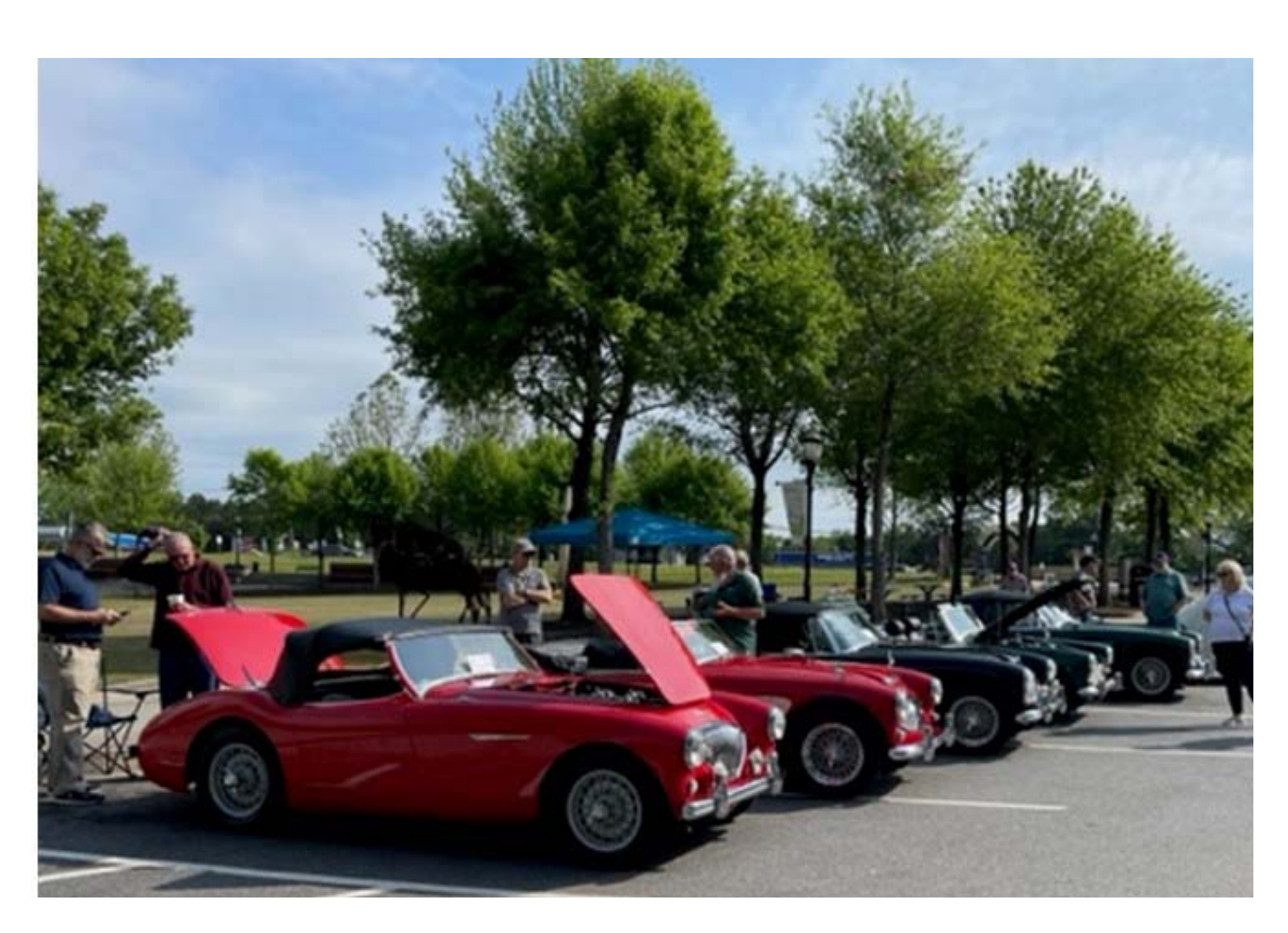
Healeys Lined up for Atlanta British Car Day

Visit our Web Site: http://www.atlantahealeys.org