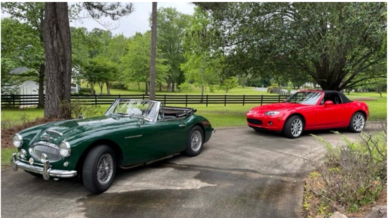
Arrival at destination One Austin Healey and one Bugeye Wannabe