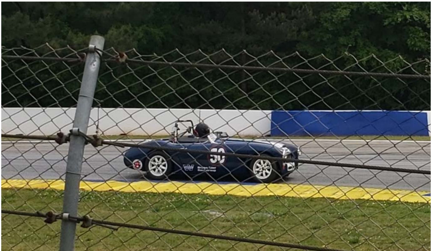
Healey At Speed - Historic Sportscar Racing Mitty Road Atlanta, May 2023