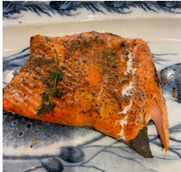
Salmon, Grilled to perfection