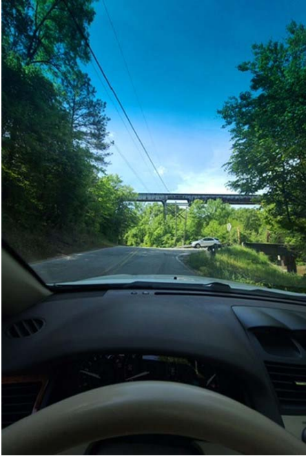
Dash-Cam View of Trestle Bridge