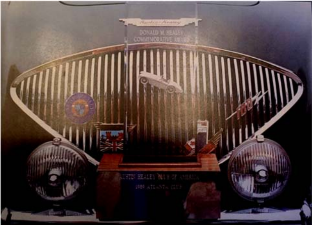
DMH Award goes to AAHC 1989