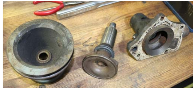
Disassembled water pump. This is as far as we go during session one.

https://precisionsportscar.com/shop/wpk002/