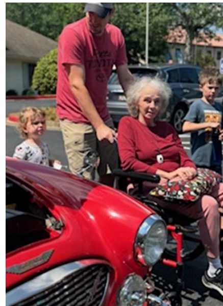
Residents enjoying the Healeys on display