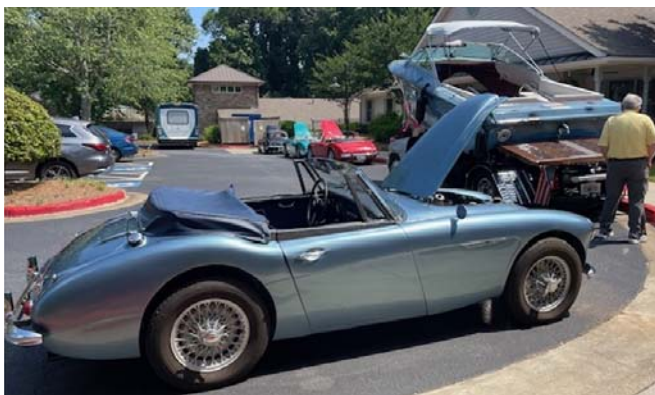
Little Snapper Healey goes after the big Fish

They were also joined by a sharkboatdump-truck that drew much of the attention.