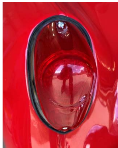
Lucas L549 Tail Light