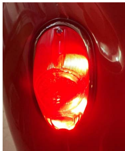
With "high-output" incandescent bulb