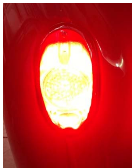
LEDs on Stop !

At work, the saying is the juice worth the squeeze? In this case where visibility may be a critical issue, I would have to say yes.