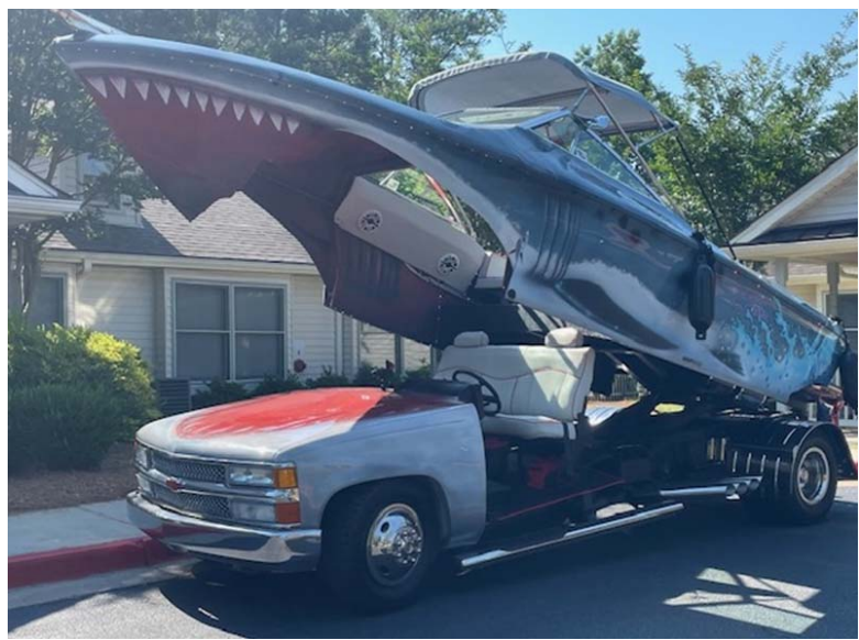
Sharkboatdumtruck the land shark version of JAWS