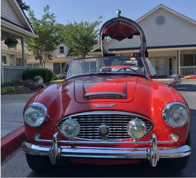
Unsuspecting BT7 about to be chomped by Jaws